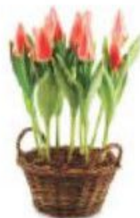
^ Spring tulips

Easter is a time to celebrate the Resurrection of Jesus Christ. We celebrate the miracle of his coming back to life after death.