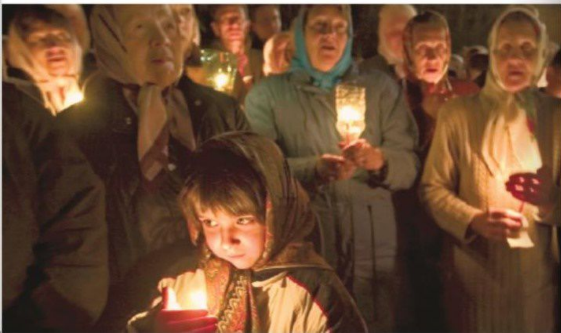
< In Peremilovo, Russia, people hold candles during a church service the night before Easter.