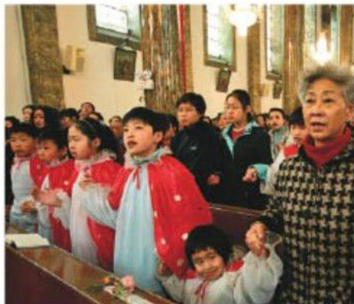
A Chinese Catholics sing during an Easter service in Beijing, China.

Holy Father, accept our evening sacrifice, the offering of this candle in your honor. May it shine continually to drive away all darkness. May Christ, the Morning Star who knows no setting, find it ever burning—he who gives his light to all creation, and who lives and reigns forever and ever. Amen.