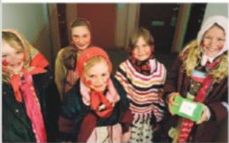
< Swedish girls on Easter Eve.

On Easter Eve we celebrate the light of Jesus. For many of us it is the most important celebration of the year. In many churches, people make commitments to Christianity—we have baptisms and confirmations.