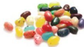
Λ Jelly beans

Easter candy! We eat lots of candy! Chocolate bunnies, cream-filled chocolate eggs, jelly beans, marshmallow chicks, and more.