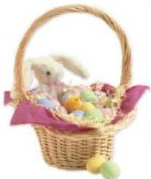
^ An Easter basket

Easter morning brings special treats, too. Could it be the Easter Bunny was here? We get baskets of eggs—colored, decorated, and chocolate! Yummmm. In Germany, it's the Easter Hare who brings us eggs. Bunnies, chicks, and eggs are symbols of new life.