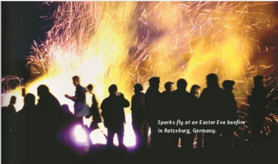
Sparks fly at an Easter Eve bonfire in Ratzeburg, Germany.