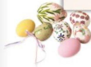
^ Painted Easter eggs

In March or April, Christian people all over the world celebrate Easter. We celebrate with colored eggs, flowers, and prayer.