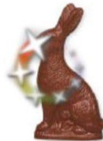
Λ A chocolate bunny