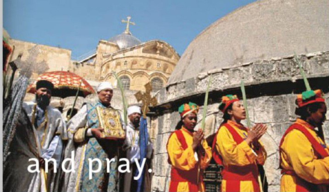
^ Christians in Jerusalem, Israel, celebrate Palm Sunday.

On the Thursday before Easter, some of us follow the custom of washing other people's feet, just as Jesus washed the feet of his followers. We also donate money or food to those in need.